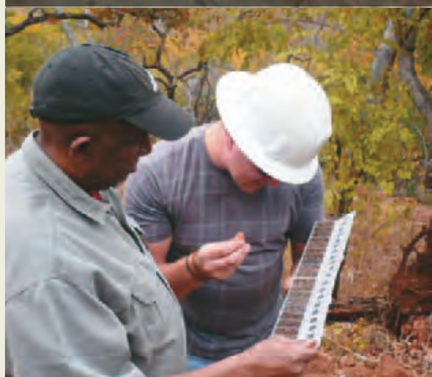
Mount Muambe REE - Fluorite Project, Mozambique