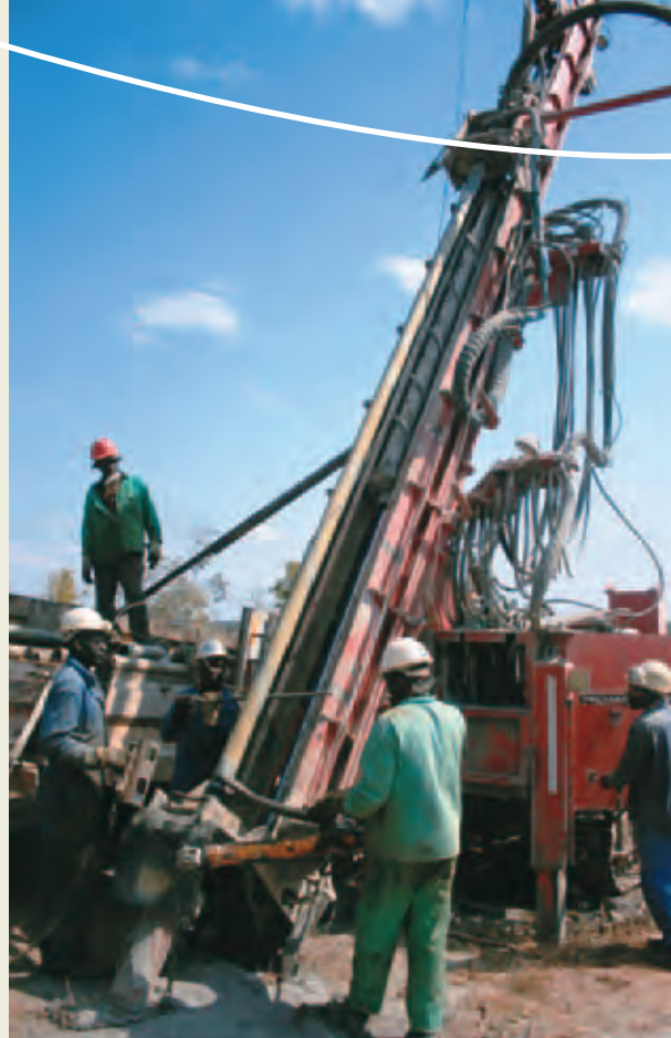
RC Drilling - Kanyika Niobium Project, Malawi

Following a successful exploration program in 2010, Globe is set to commence a drilling program at the Machinga North prospect. A planned 2,000m drilling campaign will test the six known zones and focus on extending the established area of heavy rare earth mineralisation. In October 2011, Globe will commence a 3,000m drilling program following the identification of targets through soil sampling. Results should be announced in December.