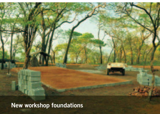
New workshop foundations

Early rock-chip sampling from the Project shows a high-grade, almost pure ilmenite mineralised horizon averaging 47% titanium dioxide. Additionally, near-pure magnetite samples with Fe values averaging 66.8% were returned from an additional zone.